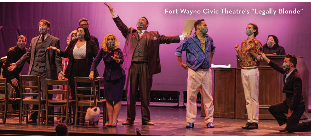
Fort Wayne Civic Theatre's "Legally Blonde"

Arts United is a private, nonprofit organization that serves twelve counties of Northeast Indiana as a local arts agency through arts advocacy and promotion, fundraising and grantmaking, back-office business support, community and economic development, and Arts Campus Fort Wayne coordination.